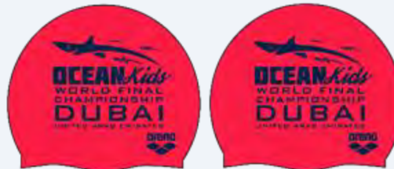
OCEANKIDS WFC MALE/FEMALE