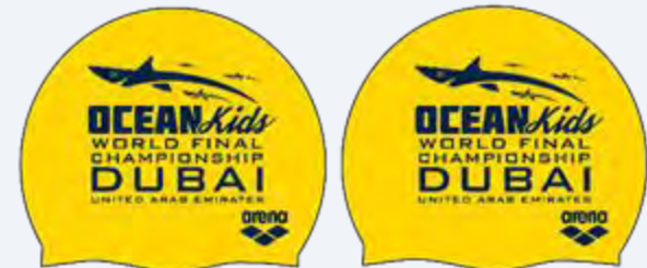
OCEANKIDS OPEN MALE/FEMALE