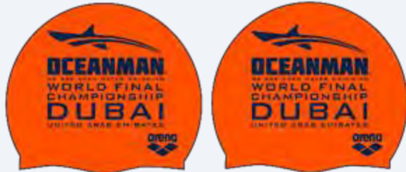
SPRINT WFC MALE